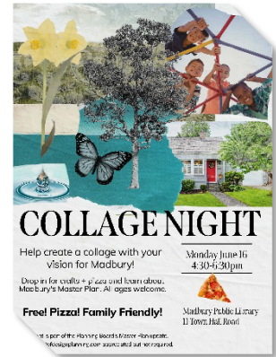
A collage night at the library provided residents of all ages the chance to share their vision for Madbury through art.