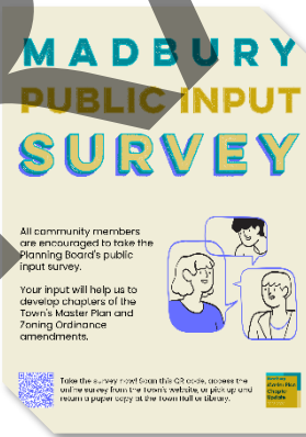
145 people responded to the Planning Board's survey and shared what they wanted for their community in the future.