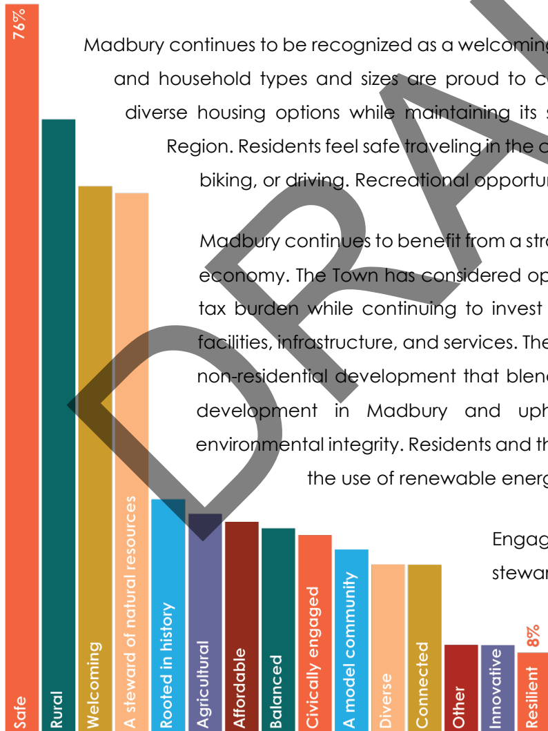
In 10 years, what words would you like to hear others use to describe Madbury?

Engaged citizens, mindful development, stewardship of natural and water resources, and community preparedness make the community a resilient and sustainable place.